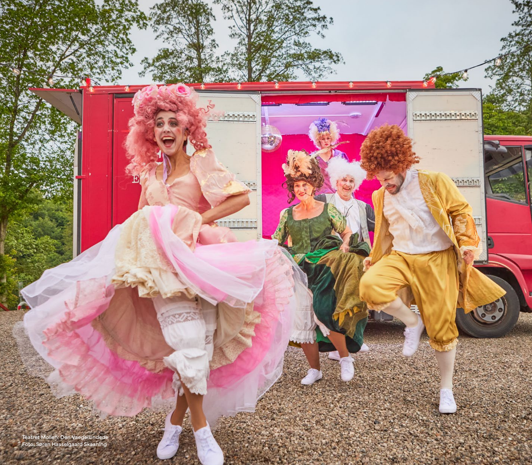
Teatret Mollen: Den Vaegelsindede